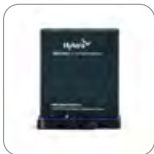
Battery (3000 mAh)