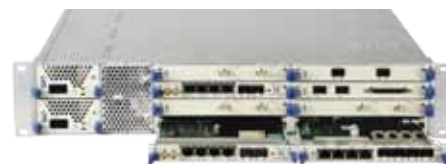
AGS20L 2RU - 8 modular slots

AGS20L aggregates traffic incoming from multiple IF based ODU and Ethernet based full outdoors, all feeding into a single node. Its modular design offers full redundancy (no Single Point of Failure) regardless of the radio configuration, improving resiliency of aggregation and backbone sites.