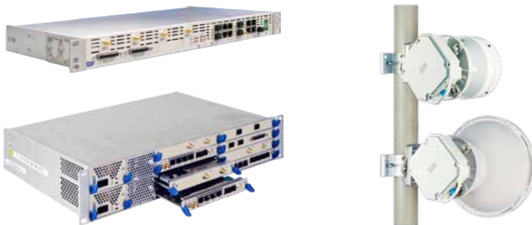
AGS20 SERIES IDUs and ODUs