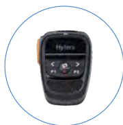
Wireless Remote Speaker Microphone