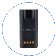
4,000 mAh Smart Battery