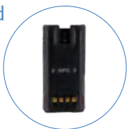
2,400 mAh Li-Polymer Battery