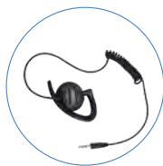
Receive-only Swivel Earset