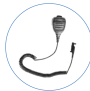
Water-proof Remote Speaker Microphone