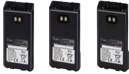
BP-278 BP-279 BP-280

BP-280: 2400 mAh (typ.), 2280 mAh (min.) rechargeable Li-ion battery.