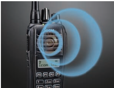
1500 mW powerful audio