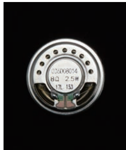
Icom custom high power handling capacity speaker