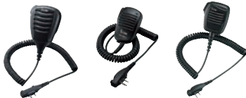
HM-168LWP HM-158LA HM-159LA

HM-159LA: Speaker microphone with 3.5 mm earphone jack.