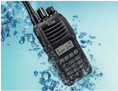
Waterproof for 30 minutes at one meter