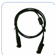
13-Pin Connector Cable Clip for fixing the RSM