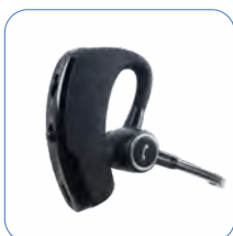
BT Earpiece PPT Volume control Microphone adjustment