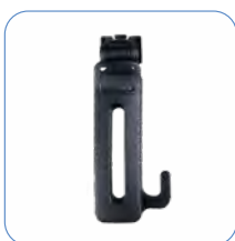
Belt Clip Carry Accessory