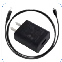
Power Adapter MicroUSB