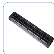
Multi-Unit Charger Six docks for BWC and batteries With MicroUSB port to acquire data