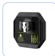
Magnetic Belt Clip Carry Accessory