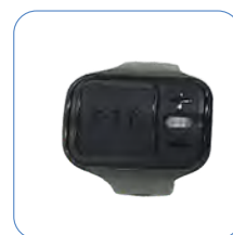
Wireless Ring PPT PTT Volume Control