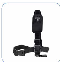
Shoulder Strap Carry Accessory