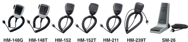
HM-148G HM-148T HM-152 HM-152T HM-211 HM-239T SM-26