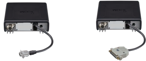
Optional OPC-1939 installation image Optional OPC-2078 installation image