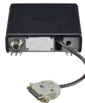
Optional OPC-2078 installation image