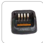
MUC Rapid-rate Charger