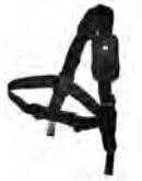
Shoulder Strap Harness