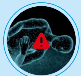
Man Down Alarm