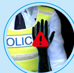
Camera Blocked Alarm