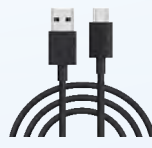
USB Type-C Data Cable